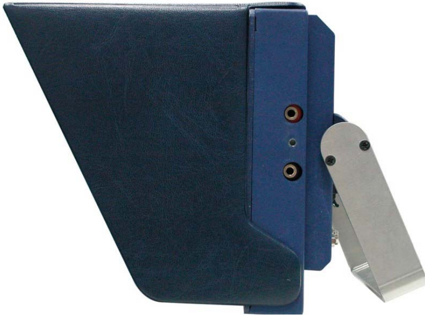
(Sun Shade on TLM-70D)