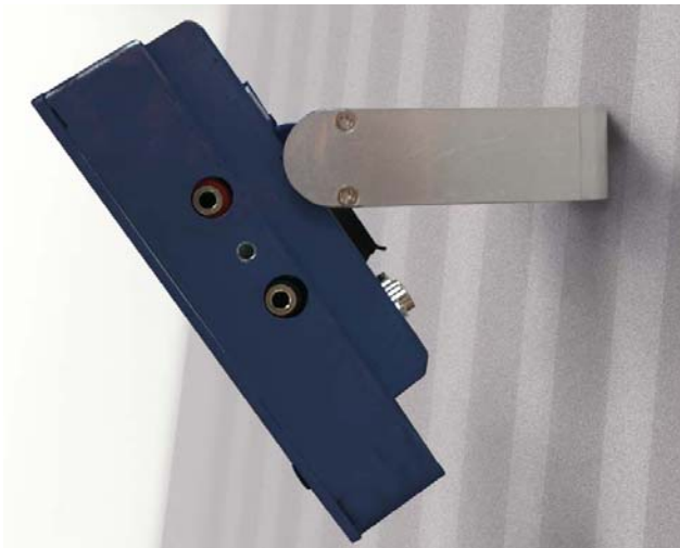
(TLM-70D Mounting on Wall)