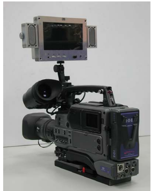
(TLM-70D on Camera)